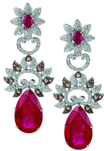
SHEHZAD ZAVERI - MINAWALA