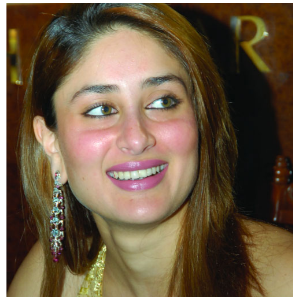
KARISHMA KAPOOR AT SHOBHA ASAR