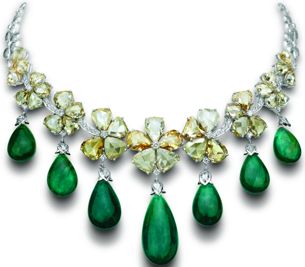
BIREN VAIDYA - ROSE