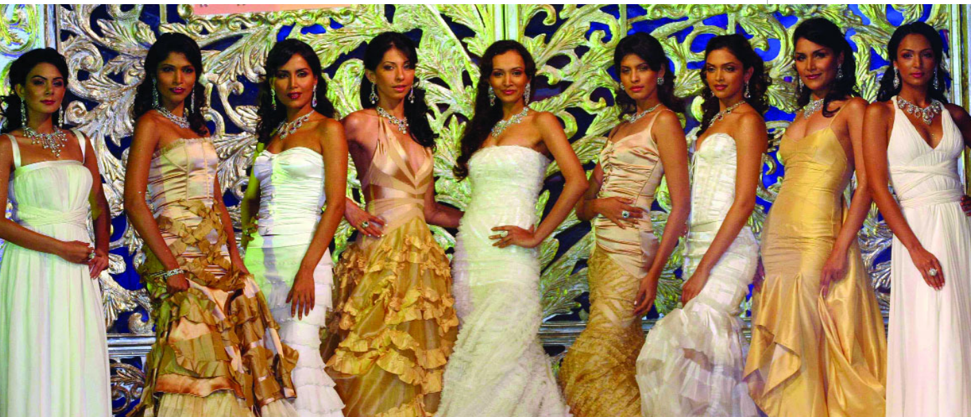
FARAH KHAN SHOW AT MAHESH NOTANDASS